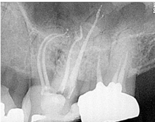
Coronal minimally invasive access. Buccal canals shaped with Bassi Logic™ 25/.03 and palatal canal with 30/.05. Case submission by Key Fabiano, DDS, Brazil

All Bassi Logic™ files are designed to preserve dentin. Bassi Logic™ is a true